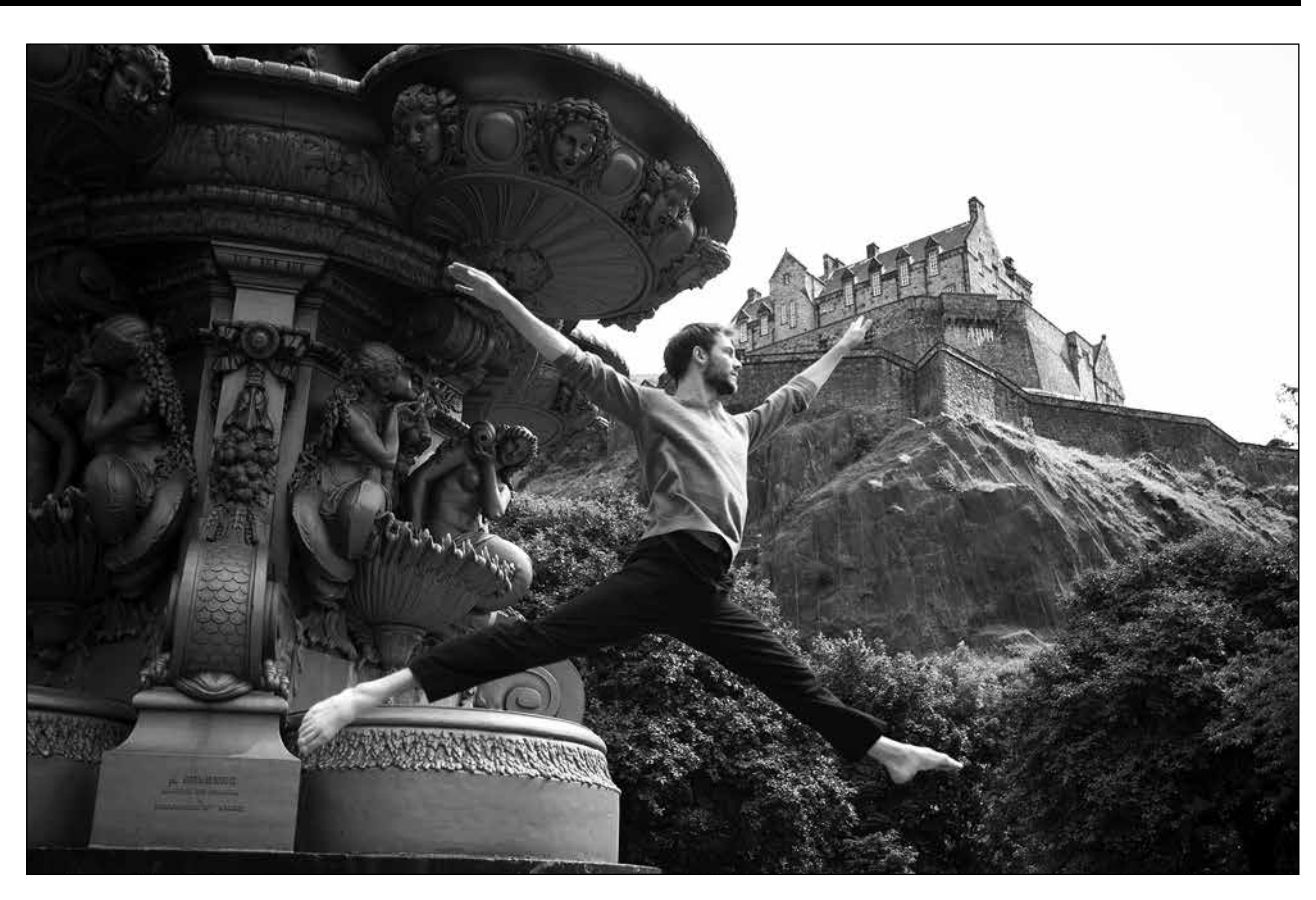
SNAP OF THE DAY: Back in Edinburgh after a sell-out run at Fringe 2011, Smallpetitklein Dance Company's evocative 'Within This Dust' at Dance Base.