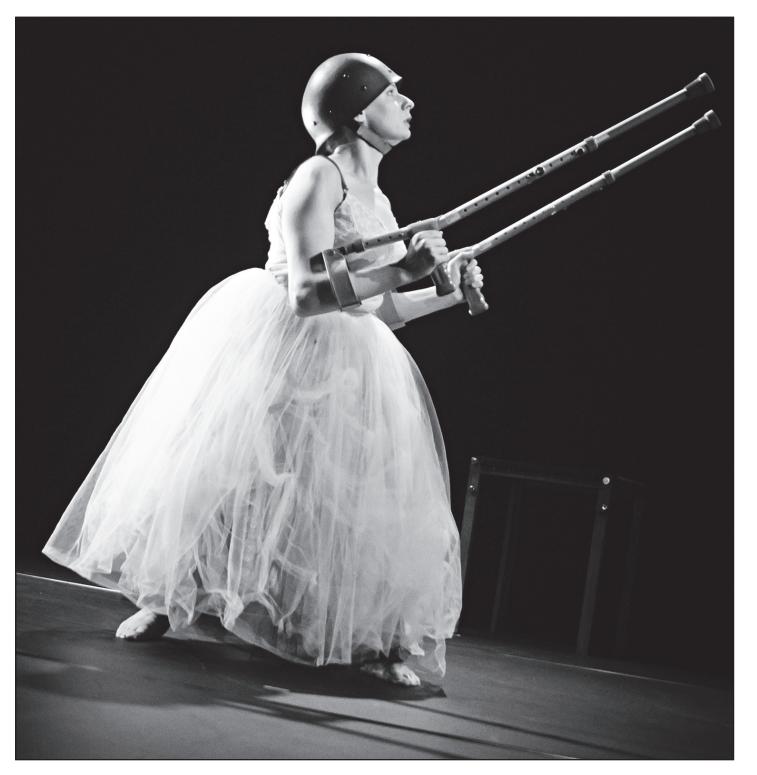
SNAP OF THE DAY: National Theatre of Scotland's 'Ménage à Trois' at Paterson's Land.

most of all, have your wits about vou, to survive the White: the bewildering, blustering space of endless emptiness, beyond where no man has gone. Thankfully, Antler Theatre have all the necessary vigour and striking ingenuity in hand. A rugged, minimalist production of saucepans and handmade tools, shaggy fur coats and woollen hats, 'Where the White Stops' is a playful and fantastically physical production, that batters you, like a blizzard, with minute after minute of innovative and hearty storytelling. Both warmingly emotive and chilling with danger and a mind-bending sense of the unknown, littered with transportive sounds and headily imaginative stories, 'Where the White Stops' treads into the territory of truly exceptional theatre.